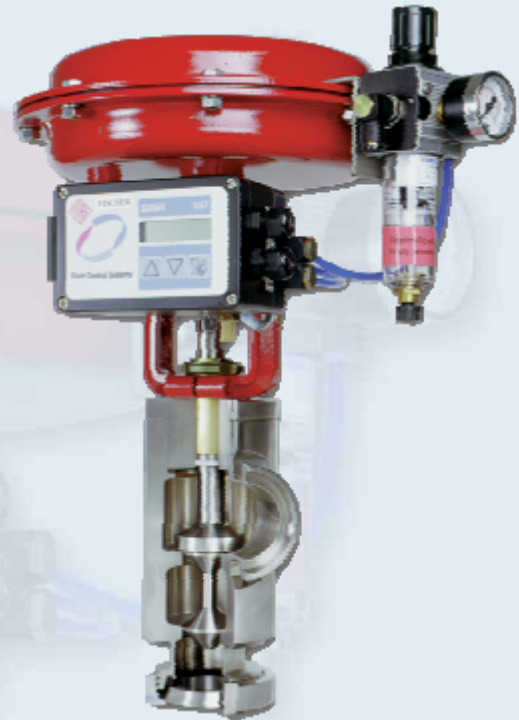
Leistungsbereiche Übersicht Capacity-Range Overview

Their multistage design guarantees both low noise emission and soft pressure reduction. Just by changing the valve disk, different characteristics can be obtained with the same valve. Fischer Hygienic Control Valves are easily exchanged and have a long lifetime.